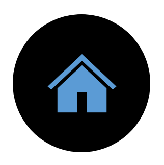
HB 544 (MINJAREZ) VOLUNTARY CERTIFICATION FOR RECOVERY HOUSING