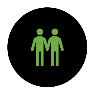
HB 705(MOODY/BLANCO) MEDICAID REIMBURSEMENT FOR PEER SERVICES PROVIDED BY RECOVERY COMMUNITY ORGANIZATION