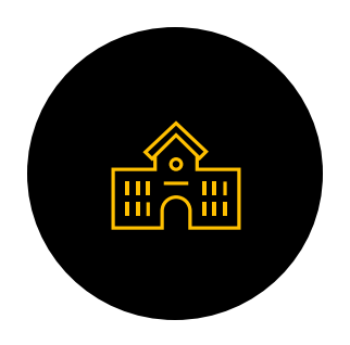
SB 2063 (MENENDEZ) STUDENT DISCIPLINE AND SUBSTANCE USE