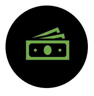
SB 1827 (HUFFMAN/ HOLLAND) OPIOID ABATEMENT ACCOUNT